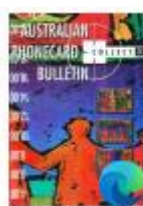
No. 3 circa Nov 1994.pdf