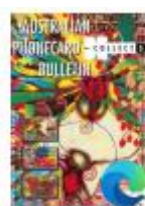
No. 5 circa Mar 1995.pdf