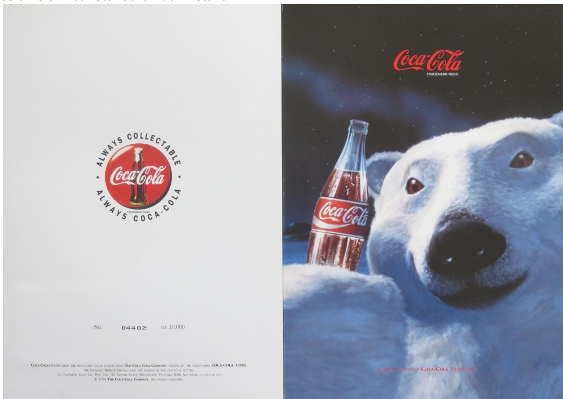
Outside Faces of Open Pack

Telecom Phonecard Card No. 04402 from Pack, shown below, matches its Pack No. 04402 , shown above