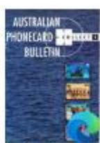
No. 2 circa Aug 1994.pdf