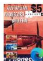
No. 6 May 1995.pdf