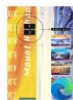
No. 1 circa Jun 1994.pdf