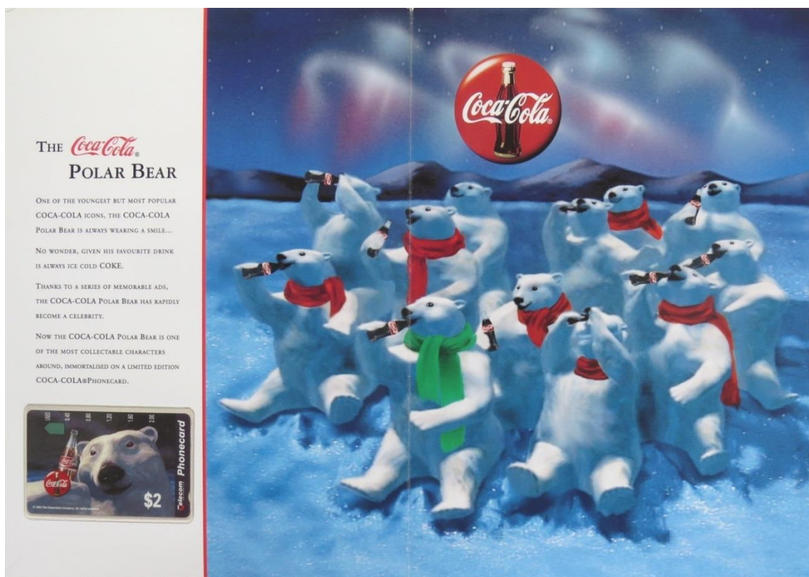
Inside Faces of Open Pack