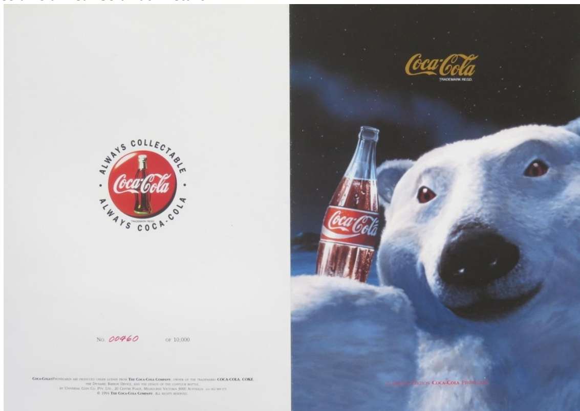
Outside Faces of Open Pack

Telecom Phonecard Card No. 00460 from Pack, shown below, matches its Pack No. 00460 , shown above