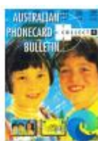
No. 4 circa Jan 1995.pdf